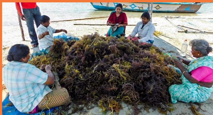
Field observations during scoping meeting in Tamil Nadu.

At the date of writing, the project has completed its scoping work at both the India and Kenya field sites, and is well advanced in preparing the dialogues planning meeting that will be done electronically. Most international and domestic travel has been suspended due to the COVID-19 pandemic lockdown, and the project teams have developed plans to cope with three different scenarios—short-term, medium-term and long-term lockdown arrangements.