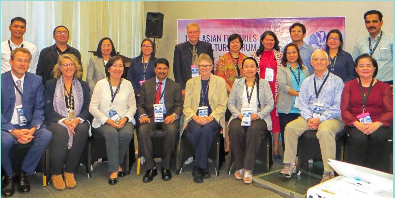
Attendees at the Joint General Assembly of the AFSSRN and GAFS during 12AFAF on April 10, 2019.

Gender: https://www.seafdec-oceanspartnership.org/wp-content/uploads/USAID-Oceans_Gender-In-Fisheries_Training-Guide_March-2019.pdf