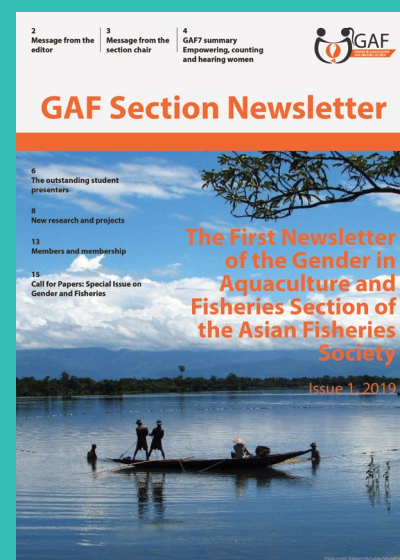
The first GAFS Newsletter