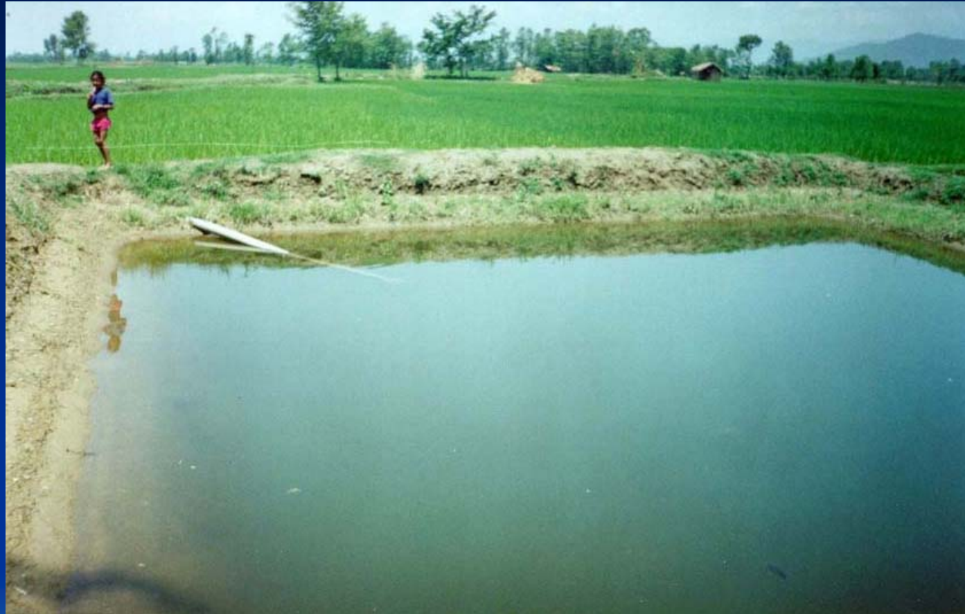
A girl taking care of her fish in her green pond surrounded by rice field