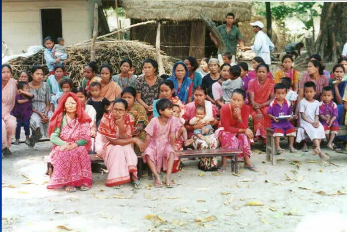
Women gathering to discuss about the project