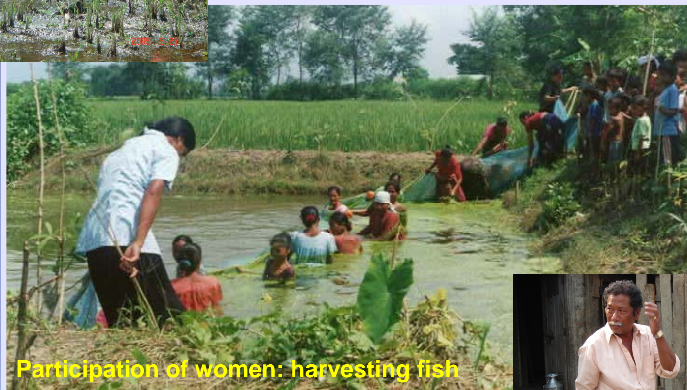
Participation of women: harvesting fish