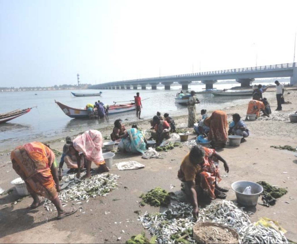
Sorting of trash fish by coastal women