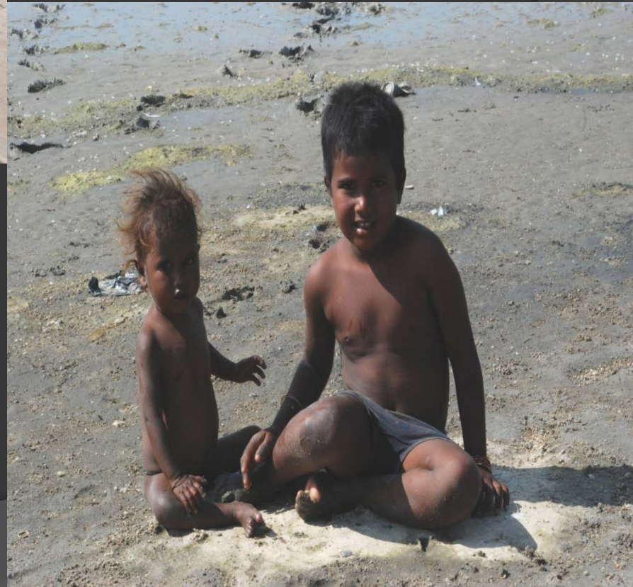
Children waiting for their mother's to return from wild shrimp and clam collection